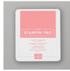
Flirty Flamingo Classic Stampin' Pad - 147052