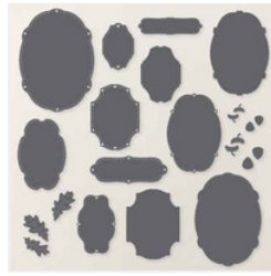
Sweet Words & Labels Dies - 167627