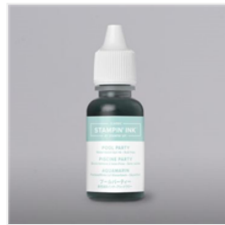
Pool Party Classic Stampin' Ink Refill - 122933