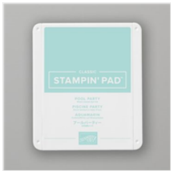
Pool Party Classic Stampin' Pad - 147107