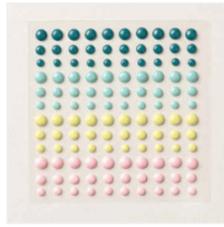
Array Of Dots - 167559