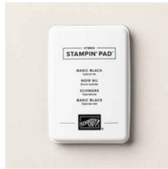
Basic Black Hybrid Stampin' Pad - 166648