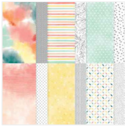
Beautiful Ordinary Life 12" X 12" (30.5 X 30.5 Cm) Designer Series Paper - 167553