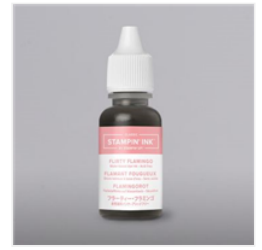
Flirty Flamingo Classic Stampin' Ink Refill - 141402