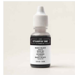
Basic Black Hybrid Stampin' Ink Refill - 166649